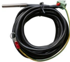
Remote temp. sensor RTS300R10K5.08A