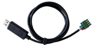
PC communication cable CC-USB-RS485-150U-3.81