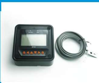
Remote meter MT50